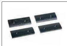
supports for cylinder or tube workpieces (included)