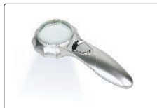
magnifier with LED (included)