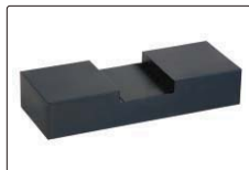
flat anvil for test block (included)